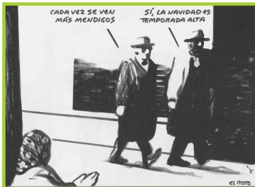
* El Roto (Andrés Rábago) "EL LIBRO DE LOS DESÓRDENES" Círculo de Lectores, 2004